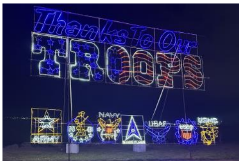
Bentleyville USA in Duluth MN tribute

People, both young and old, get lonely and depressed; make a difference in someone's day.